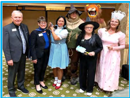
Southwest Breakfast Hosted by Kansas