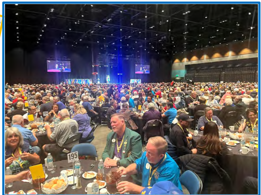
The largest and best Lions Club Leadership training events in the world. With over 80 seminar training sessions related to developing quality Lions Clubs and thousands of Lions leaders sharing their experiences. This was the 46 th USA/Canada Leadership Forum. Make plans to attend Louisville!