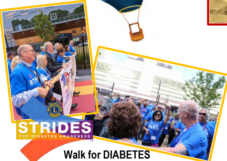
Walk for DIABETES