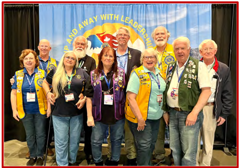
OUR MISSISSIPPI DELEGATION