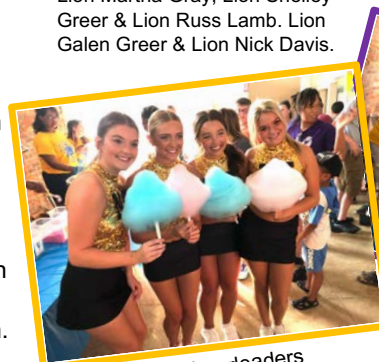
Northeast Cheerleaders visited our booth for a treat