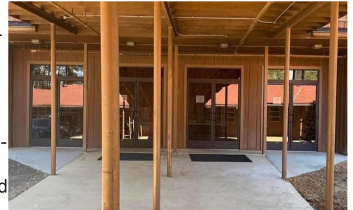
New Glass Doors Recently Installed at Hutto

I would like to follow up with information in Deanna's column from the December Grapevine about the Community name change. (Please see Hagler Page 2.)