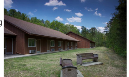
Retreat Center Buildings

The response from other clusters to the challenge put forth by Marshall Cluster in March has been fantastic. A total of $15,174.00 was given to Camp Sumatanga to help cover costs needed to repair damage in Retreat Center buildings. The Board thanks all who contributed.