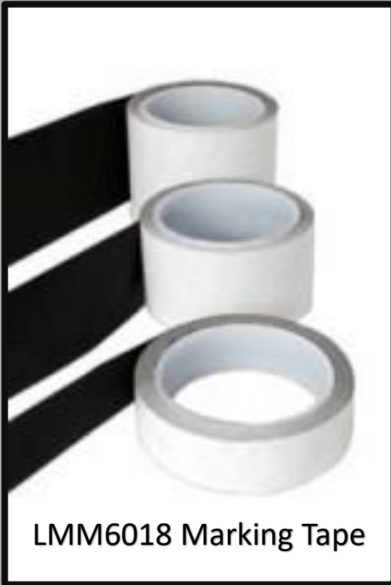
LMM6018 Marking Tape

LMM6018 and Epilog Fusion Edge 60W Laser Floyd Steinberg Fill Pattern 600 DPI P=Power S=Speed