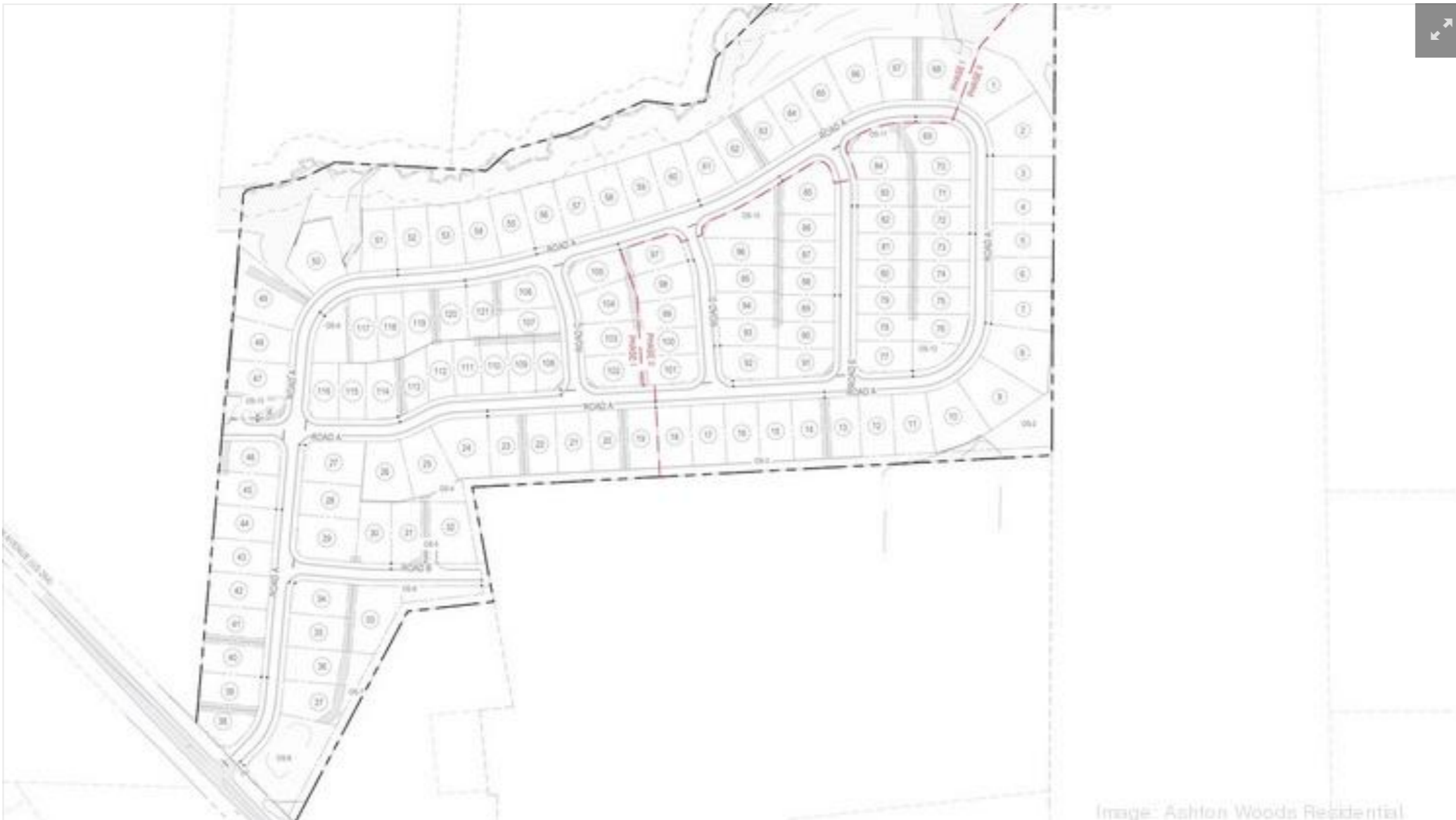
Plans for a new residential development in Nash County.

Email | Share | LinkedIn | Tweet | Share Article | Print | Order Reprints