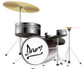
Drum mics required