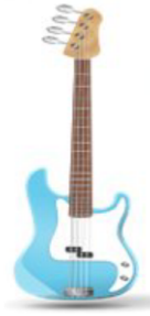
Bass built-in DI