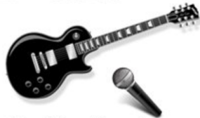
Vocal & guitar mic required