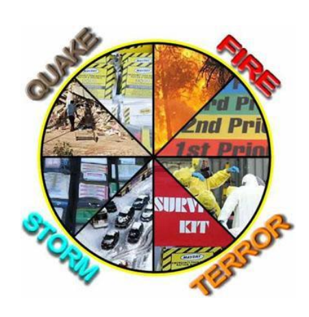
EMERGENCY PREPARNESS LOCK DOWN / SHEALTER IN PLACE / EVACUATION