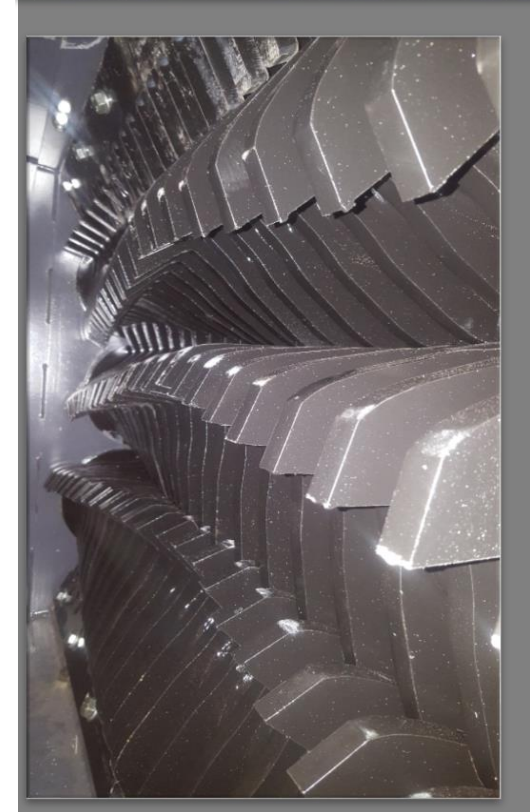
Screener/Crusher Style Blades