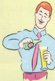
COLD STORED HOPS