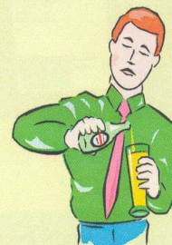
WARM STORED HOPS