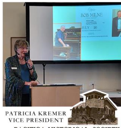
PACIFICA HISTORICAL SOCIETY