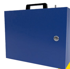
Sense Max E108104