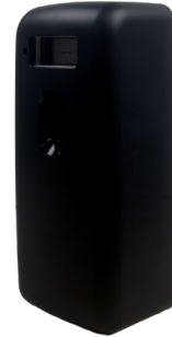
Modern Black E111102