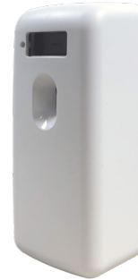
Clean White E111101