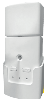
Clean White E115101