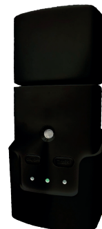
Modern Black E115102