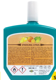
Sparkling Citrus H102241