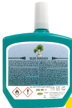
Blue Fantasy H102243