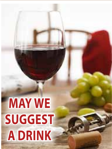
MAY WE SUGGEST A DRINK