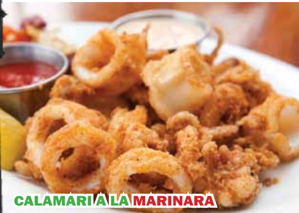
CALAMARI A LA MARINARA