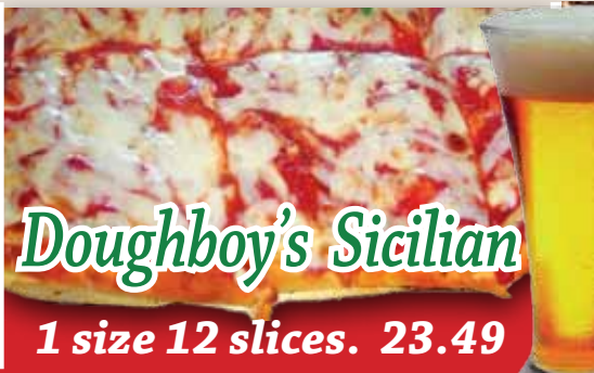
Doughboy's Sicilian 1 size 12 slices. 23.49