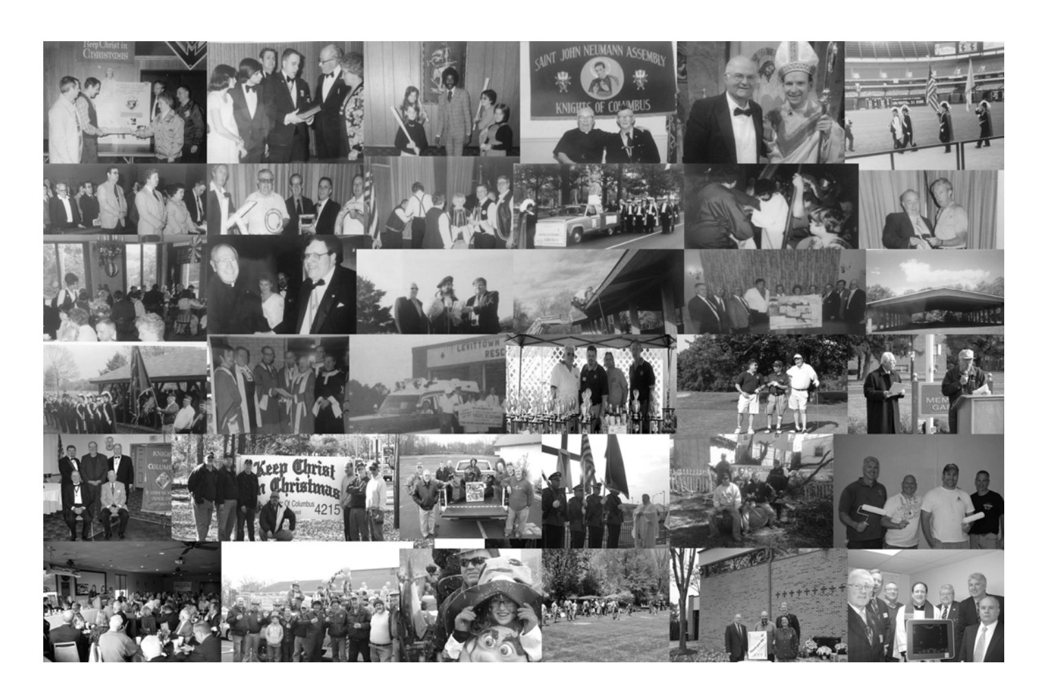
K of C St. Joseph the Worker Pictorial; Serving the Community over the Years.