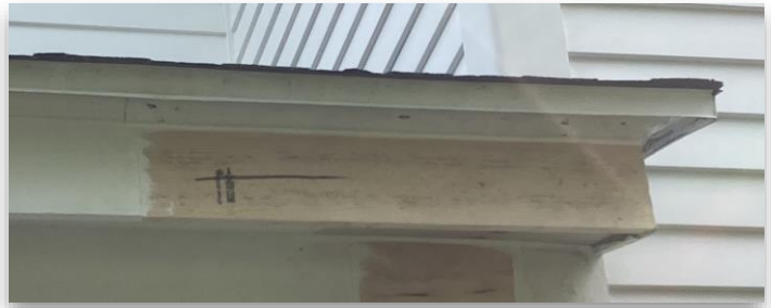
Then it's patched