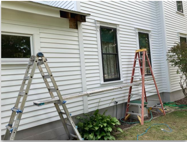
Serious rot removed