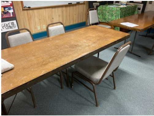
Old tables and chairs OUT