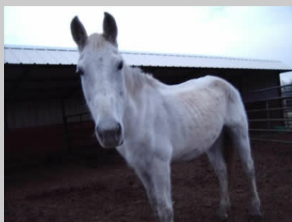
Sadie in 2009