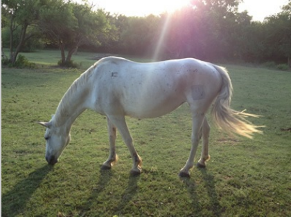
Sadie in 2013

Visit the Hope in the Valley website to see before and after pics.