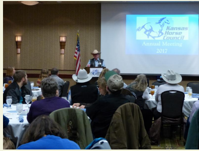
2017 Annual Meeting Capitol Plaza Hotel Topeka, KS January 28, 2017