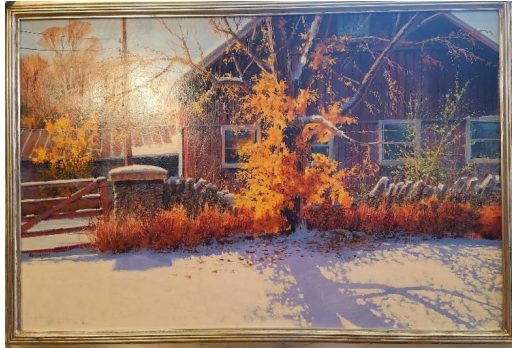
Original painting by Hugh Greer