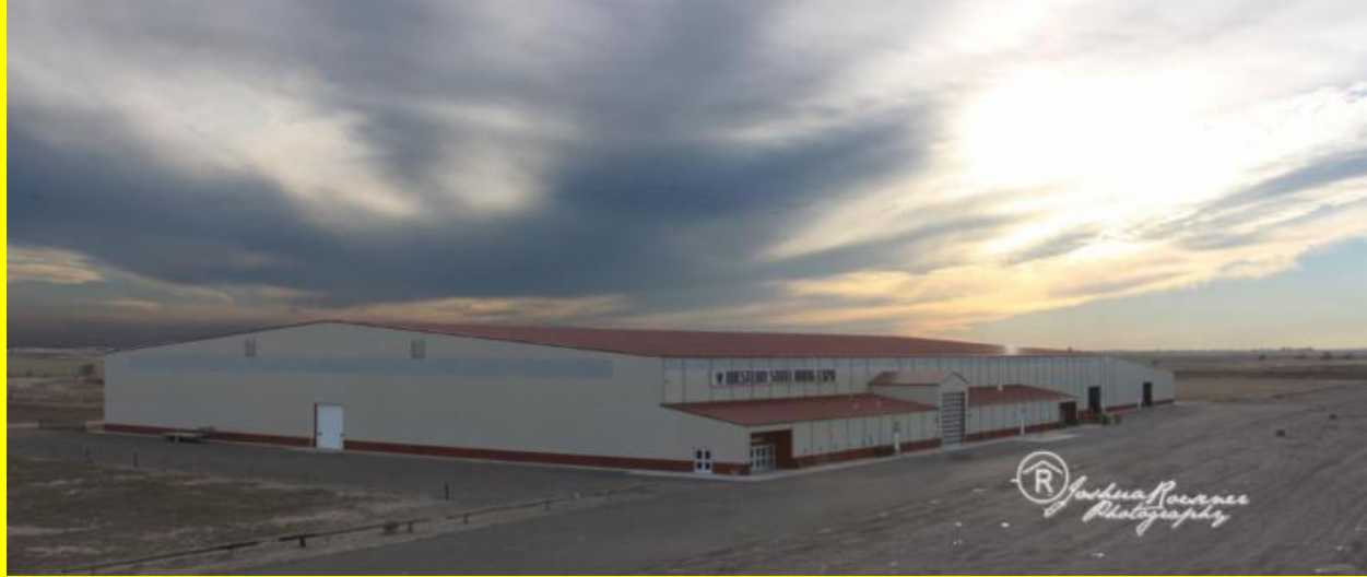
Western State Bank Expo Arena, Dodge City, KS