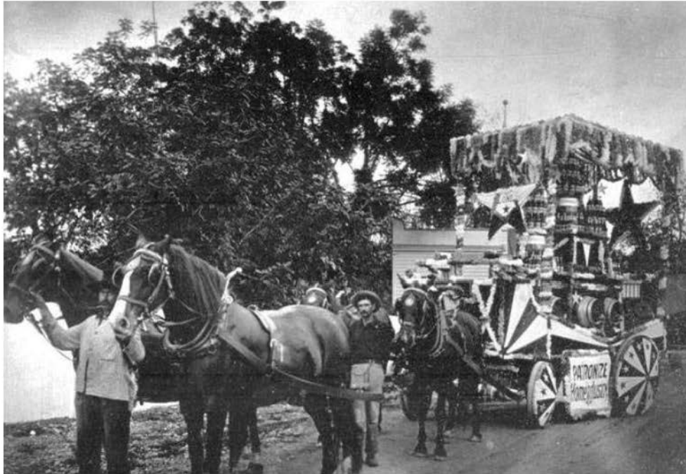
Image: REMINDER TO BUY LOCAL ADVERTISED BACK IN THE DAY DURING PARADE

MAKE A LITTLE HISTORY BY PARTICIPATING IN THE BUNKER HILL FOUNDERS DAY