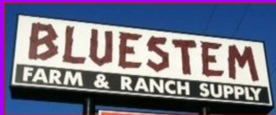
Bluestem Farm & Ranch Supply opened in 1961 on Commercial Street in Emporia and has been at the present location on West Highway 50 since 1968