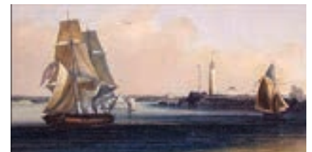
1853 painting by Fritz Hugh Lane (1804-1865)

The first lighthouse was financed by a tax of a penny a ton on all vessels coming into the harbor, and the same amount for vessels leaving the harbor. Smaller coasting vessels paid only two shillings as they left the harbor. Fishing vessels and small vessels transporting lumber and other building materials locally were taxed five shillings yearly.