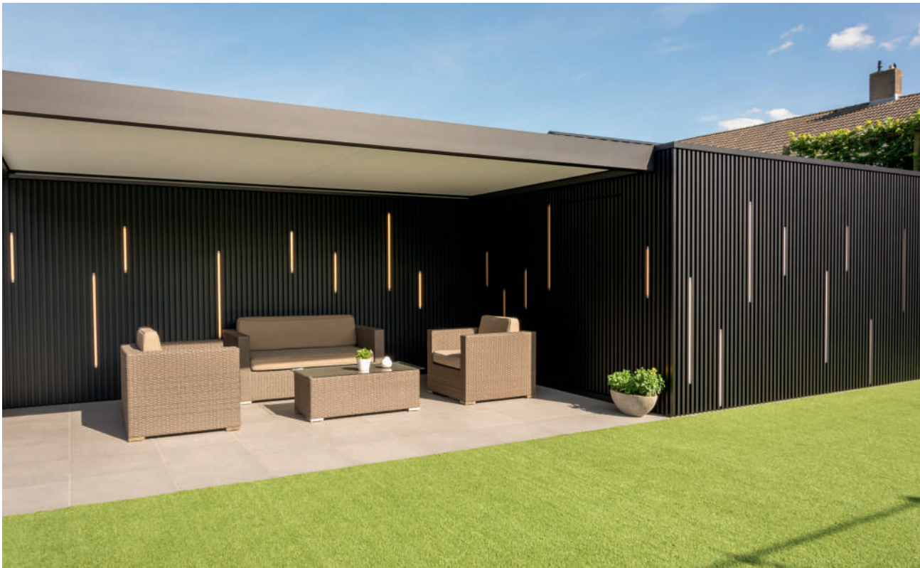
Refresh your façade with Linarte siding