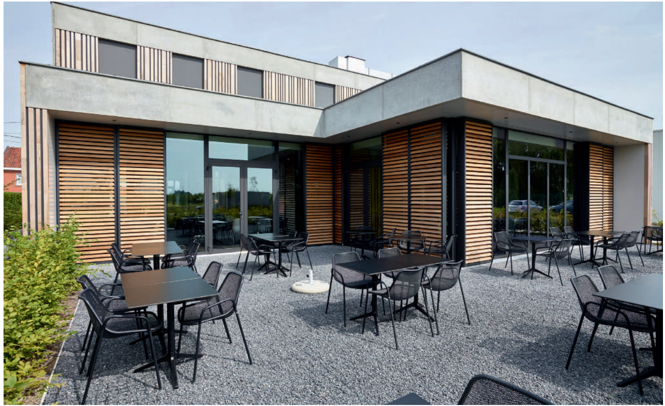
Add Loggia sliding panels