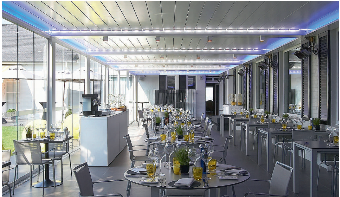
An integrated gutter system ensures dripless rainwater management.