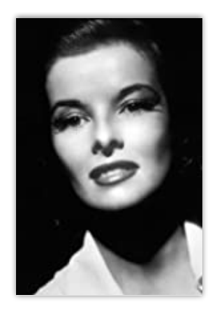
1. Katharine Hepburn