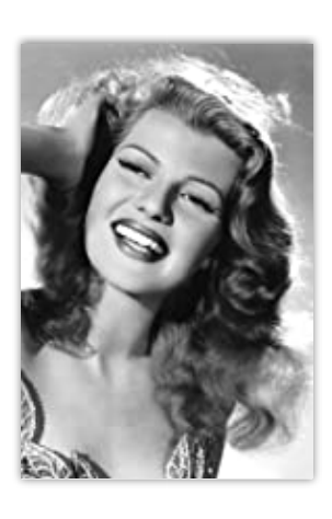
19. Rita Hayworth