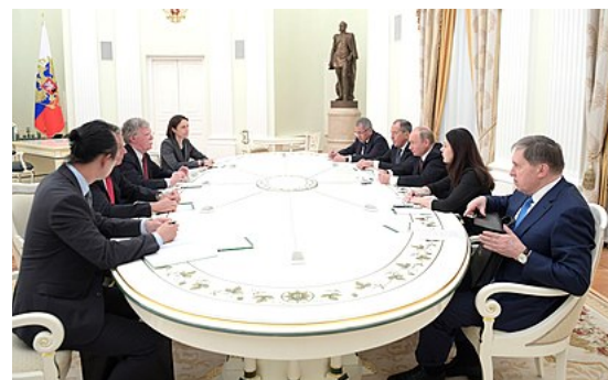
Fiona Hill (center left) with John Bolton at a June 27, 2018 meeting with Vladimir Putin