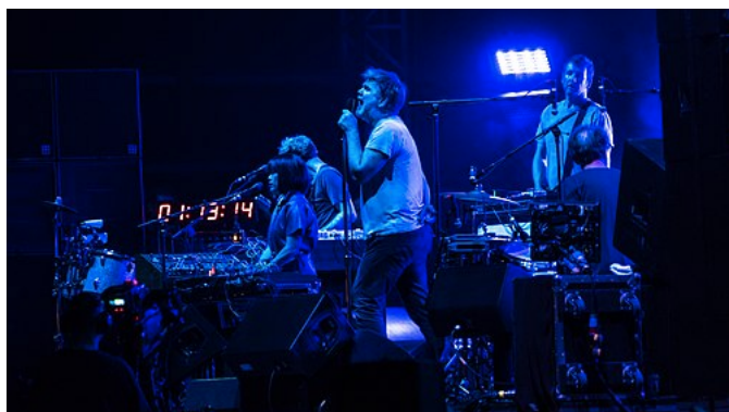
LCD Soundsystem performing at All Points East in 2018

In August 2016, the band canceled tour dates for shows in Asia and Australia in order to complete work on the album. [73] Although plans were made to release the record in 2016, it was suggested that the release date would be moved into the following year, as the recording was predicted to take another few months. [74] LCD Soundsystem performed their first show of 2017 at the then-recently opened venue Brooklyn Steel on April 6. During their performance, they premiered three new songs titled "tonite", "call the police", and "american dream" during the first encore of their set. [75]