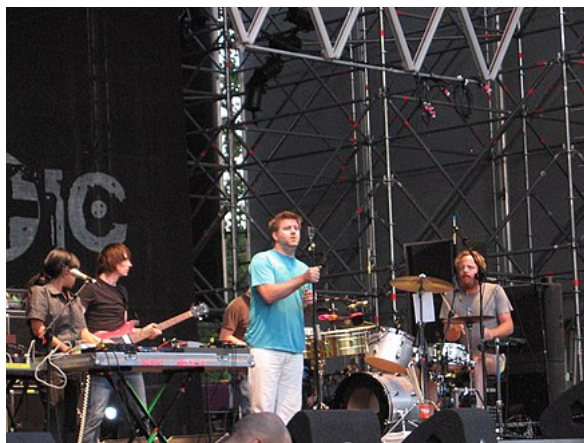
LCD Soundsystem performing in Turin, Italy in 2007

In October 2006, LCD Soundsystem released a composition entitled "45:33", as part of Nike's Original Run series. It was made available for download from iTunes. [15] Despite its name, the track is actually 45 minutes and 58 seconds long—the title is a reference to vinyl speeds (33 and 45 RPM) [15] —and was claimed to "reward and push at good intervals of a run". [16] However, it was later revealed that this was not the case, but that Murphy merely wanted the opportunity to create a long piece of music, akin to E2-E4 by Manuel Göttsching . [17]