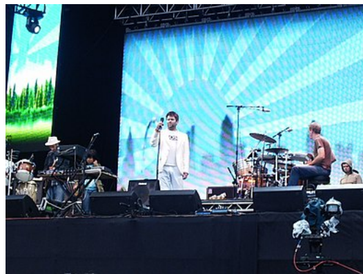
LCD Soundsystem performing in Madrid in 2005

LCD Soundsystem released their eponymous debut