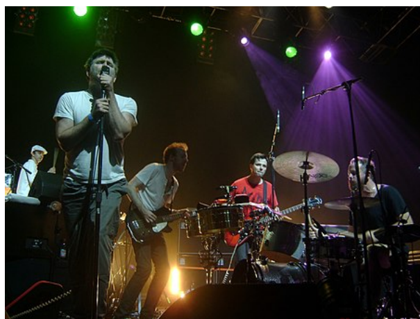
LCD Soundsystem performing in Santiago, Chile in 2011

On February 23, 2010, the LCD Soundsystem website announced that the album had been completed. The first single was set to be "Drunk Girls" and on March 25, a stream of the song was put on music site One Thirty BPM . [42] The title of the album and the cover were revealed on the DFA site on March 30. [43] The album, titled This Is Happening , was released in the UK on May 17, 2010 and in the U.S. on May 18, 2010. Prior to the release Murphy promised that it will be "definitely better than the other two." [44] Murphy stated that it was likely to be the last LCD Soundsystem album. [45] The band performed two secret gigs in New York on April 9 and April 12, 2010, at the Music Hall of Williamsburg and Webster Hall in New York City. Murphy made an impassioned plea with fans and industry attendees at the New York gig not to leak the album to the internet in advance of the May 17 release date. [46] It was reported in the NME that Murphy went down on his knees onstage and stated: