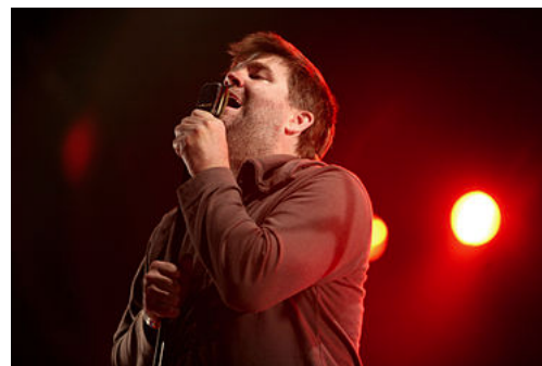
Principal member James Murphy at La Route Du Rock in August 2007