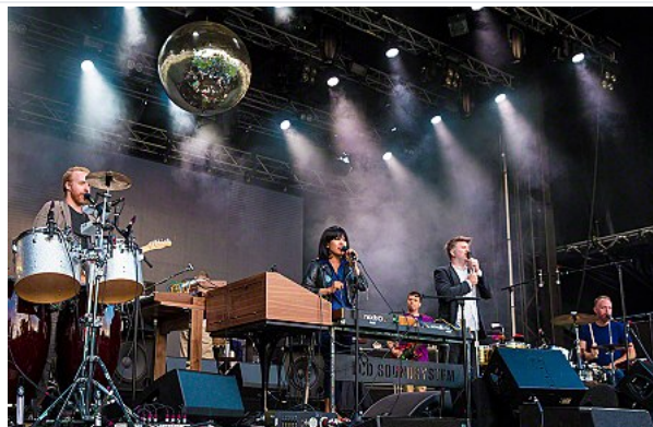
LCD Soundsystem performing live in 2016