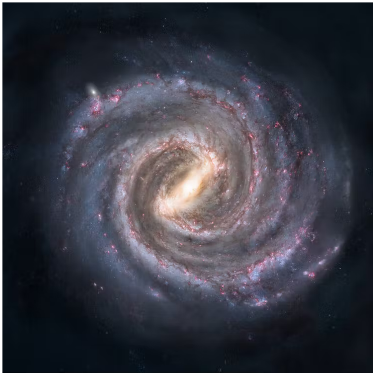
Who's the king of the galaxy?

So if planets are so plentiful, then what about life? The Drake equation, formulated by Frank Drake in 1961, attempts to answer this question by suggesting there could be many civilisations in the Milky Way that we should be able to communicate with.