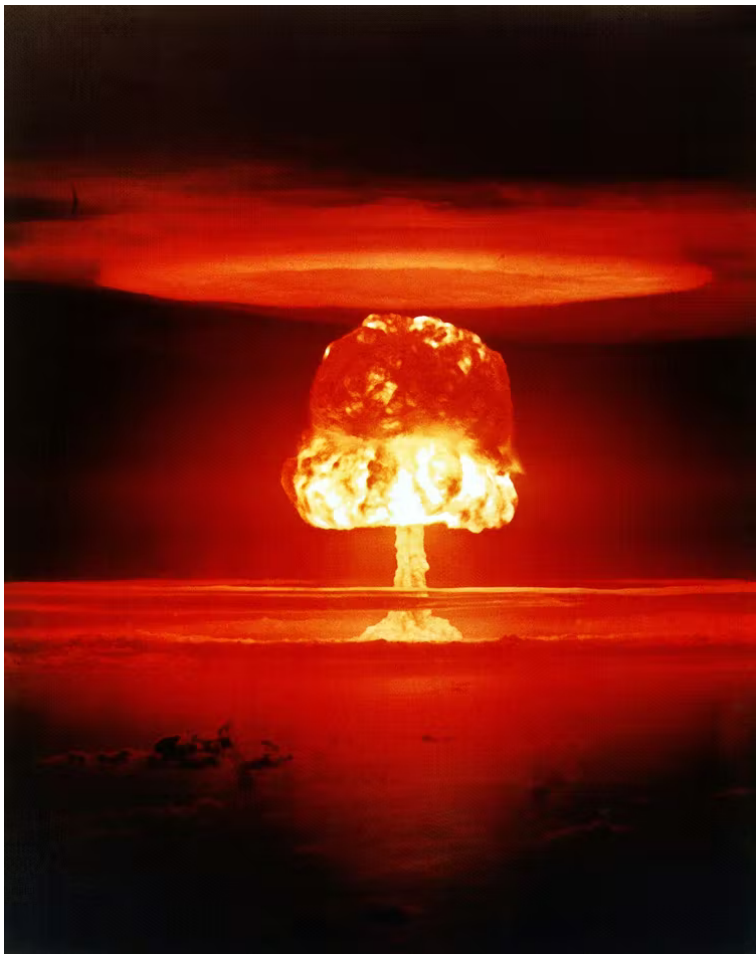
Is intelligent life destined to destroy itself?

Rare Earth: It may be that there are no civilisations in the galaxy any more advanced than we are. Perhaps the combination of astronomical, geological, chemical and biological factors needed to allow the emergence of complex, multicellular life is just so unlikely that it's only happened once.