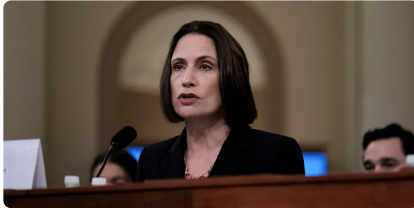
Fiona Hill, former top Russia advisor to the White House, gives testimony in the impeachment inquiry of President Donald Trump in November 2019.