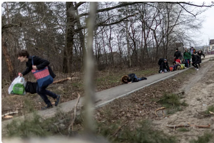
Residents look for cover as they try to escape from the town of Irpin, Ukraine, on Sunday after heavy shelling on the only escape route used by locals.

Other photographers in the area captured similar scenes of panicked Ukrainians desperately trying to escape heavy Russian shelling along the evacuation route.