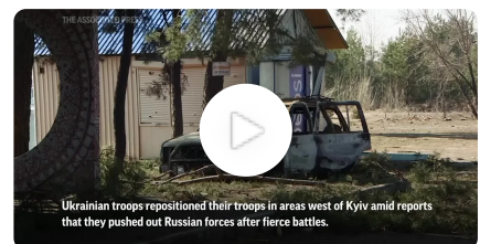
Ukrainian troops repositioned their troops in areas west of Kyiv amid reports that they pushed out Russian forces after fierce battles.