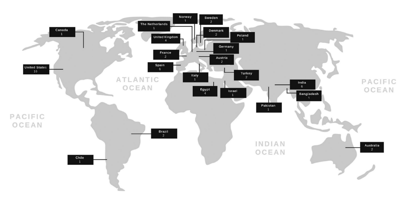
Figure 2. Global distribution of included trials (n = 59).