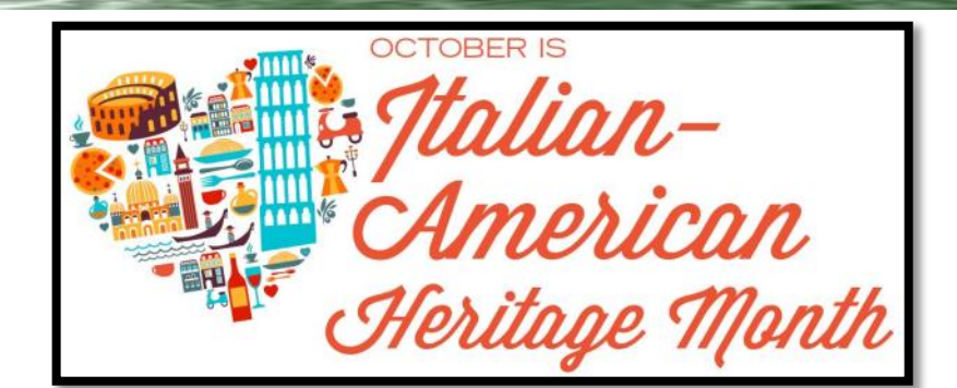
Page 3 - Italian Cultural Center of Western Massachusetts, Inc. - ottobre 2017- La Voce