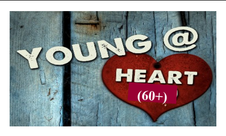
Over 60's Banquet Saturday, March 4th at 5:00 pm. Sign-up sheets are in the foyer. Make plans to attend.