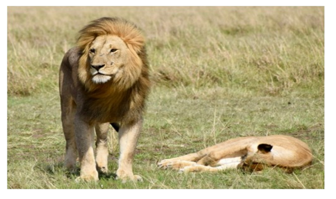
The Great Lion!

I heard this illustration and thought it was worth sharing. No matter how long it lives, the Greatest Lion will eventually die, usually in a miserable way. At their peak, they rule, chase other animals, catch devour, gulp & leave their leftovers for the hyenas and other vultures. But age comes quickly.