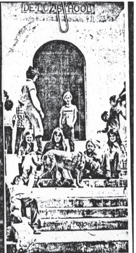
NOW OPEN — Some 25 students from the DeLuz area are attending class in the old DeLuz Schoolhouse this week and most of last week as the school was repaired to accommodate students cut