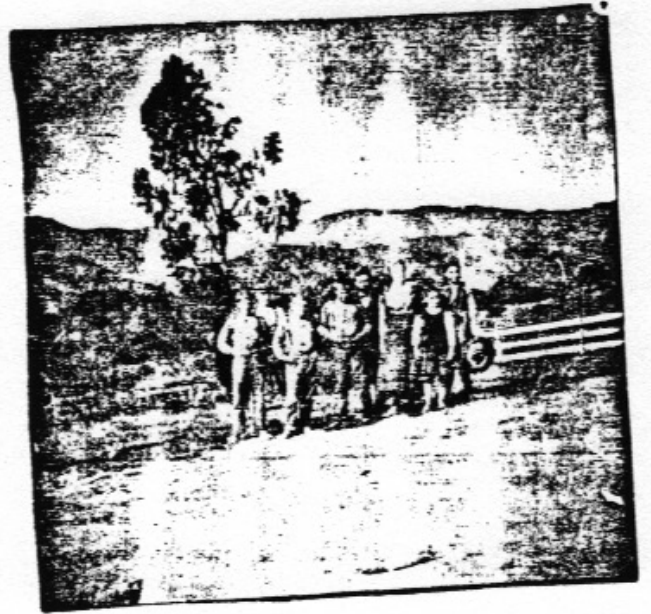
Pictures of school class before porch was added to building. 1897 Len Harvey, teacher (mustache)