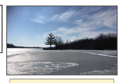
Ice Rink—Pinchot Lake—February '22

Gifford Pinchot State Park continues to be more essential to our community than ever... providing healthy outdoor activity & much needed respite for ALL! Please... consider becoming a Friend of Pinchot!