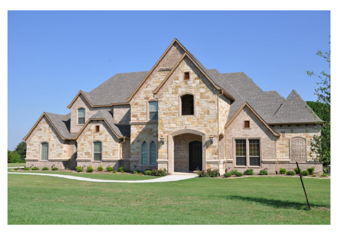
Robert Thacker Architect 7,200 sq. ft. 5 beds, 5 baths, 4 car garage