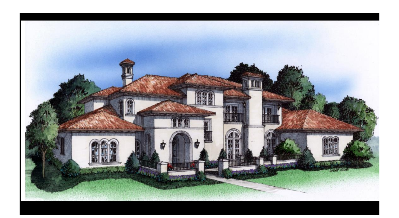
Jon Bolton Designs 7,400 sq. ft. 4 beds, 5 baths, 4 car garage