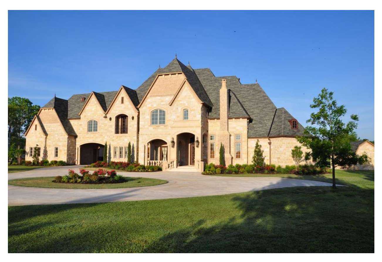
Robert Thacker Architect 10,800 Sq. Ft. 5 beds, 8 bath, 6 car garage