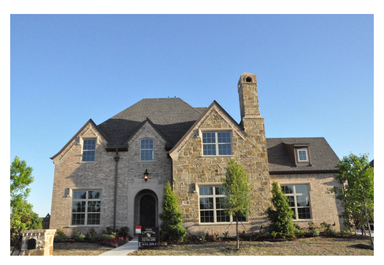
Heritage Designs Chris Hough Architect 5,000 sq.ft. 4 beds, 4.5 baths 3 car garage