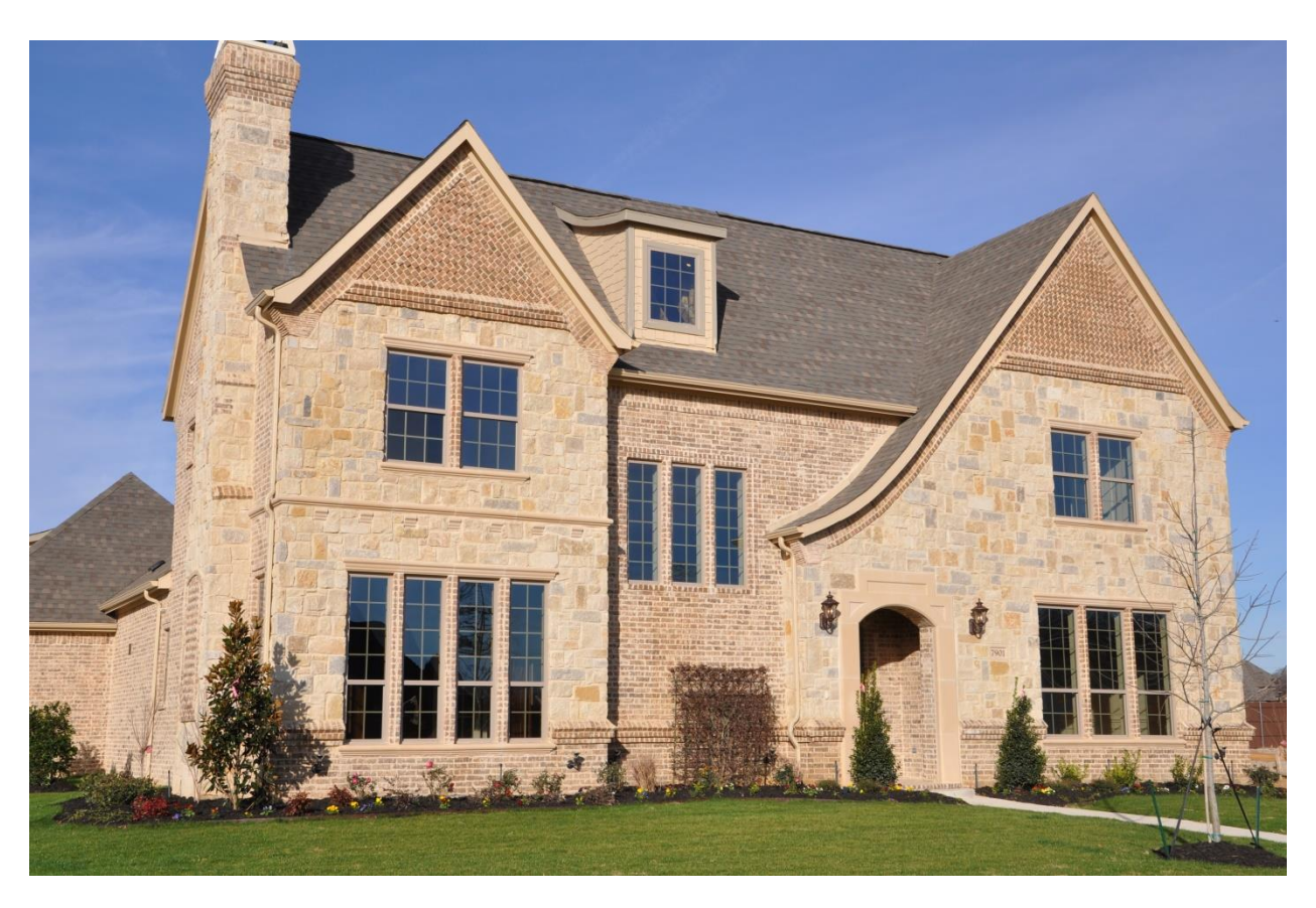
Heritage Designs Chris Hough 5,600 sq. ft. 5 beds, 5 baths, 3 car garage.