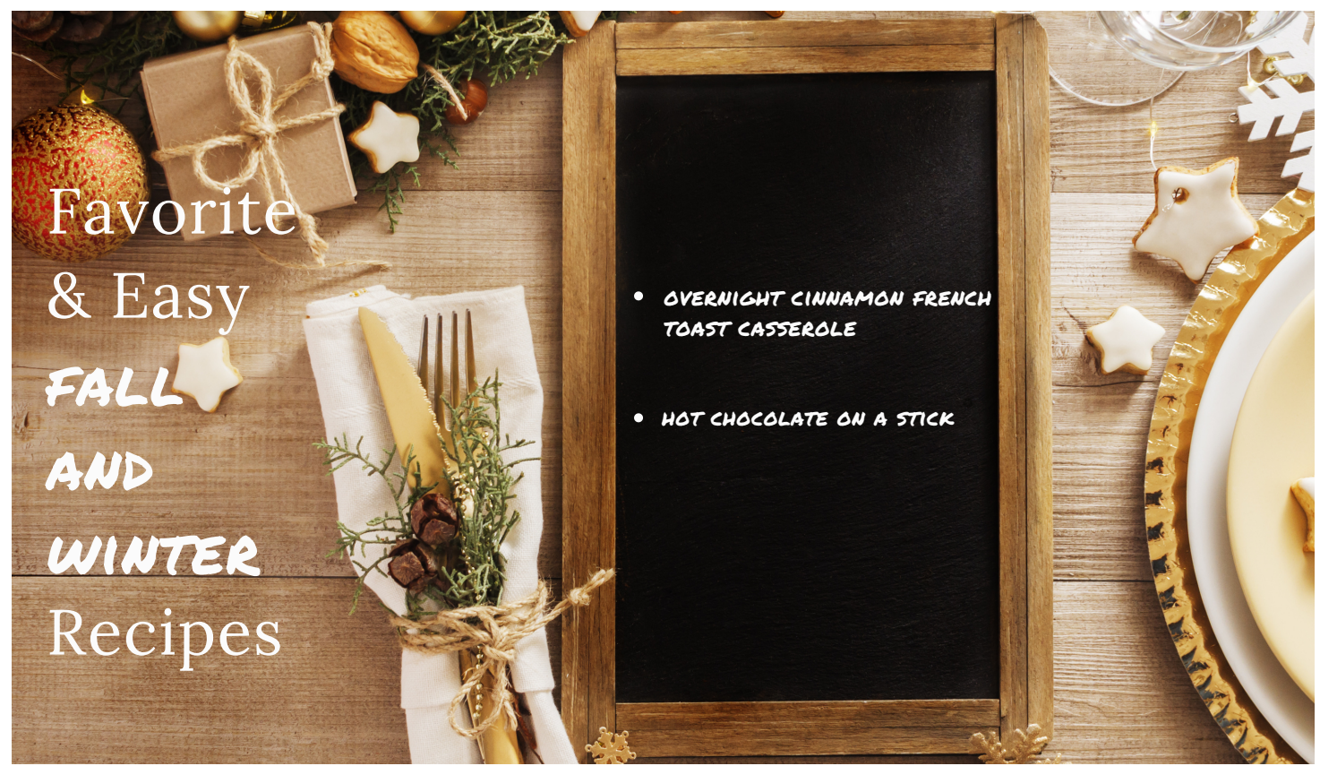
OVERNIGHT CINNAMON FRENCH TOAST CASSEROLE