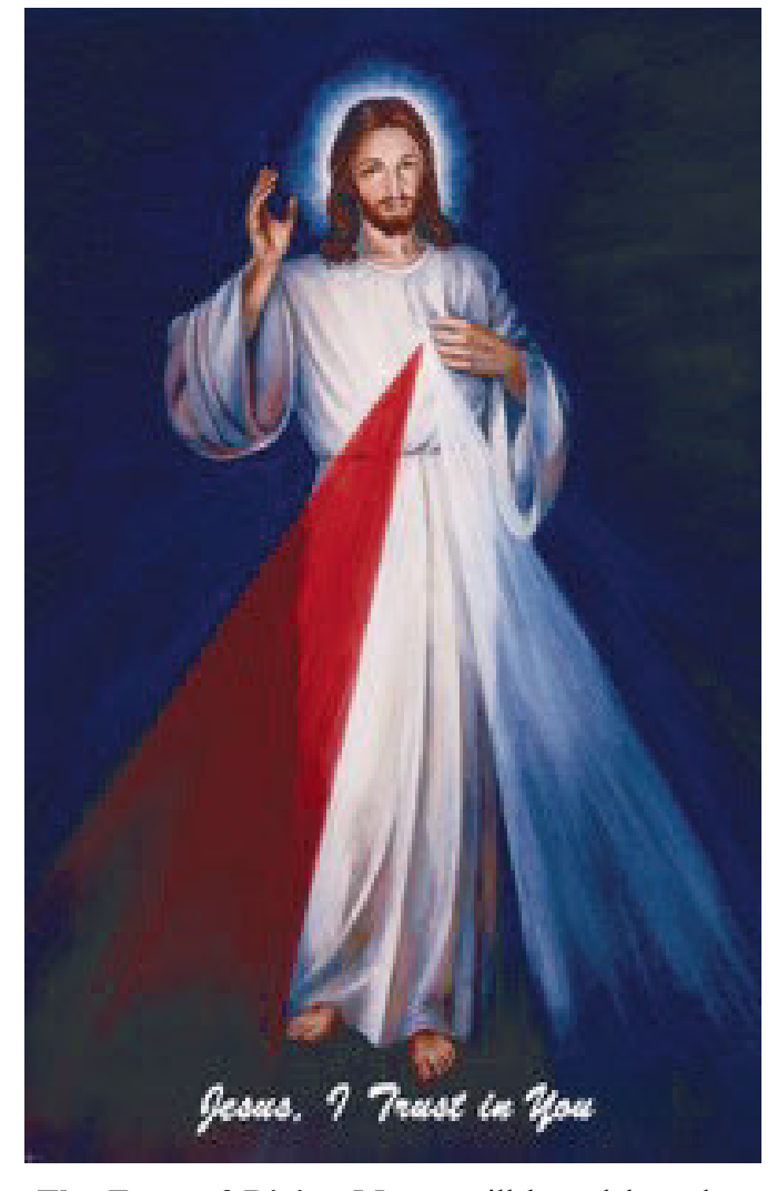
The Feast of Divine Mercy will be celebrated on April 7th at 3:00 pm in the Church. All parishioners and friends are invited and encouraged to attend. (This is not a Mass)

The Feast of Divine Mercy celebrates the "greatest attribute of God" by which undeserving sinners receive the unearned, undeserved love of Christ which is greater and more powerful than sin and death. In His Mercy is our hope and salvation.