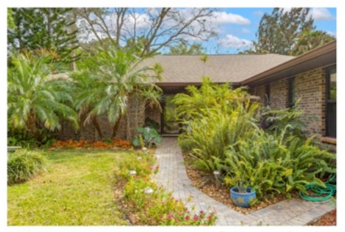
SOLD Apr 3: 6691 Towhee Dr, built 1983, 2076 SF, 3/2 on .43 acres sold for $525,000 or $253/SF.