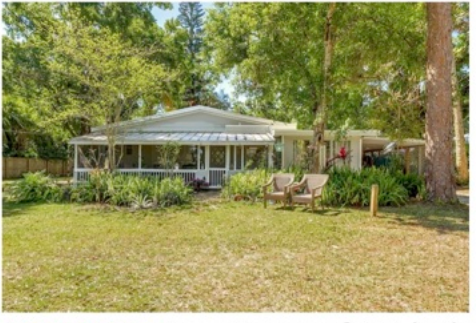
FOR SALE: 6257 Savannah Dr, built 1952, 1400 SF, 3/1 on .50 acre. Asking $398,000 or $284/SF.