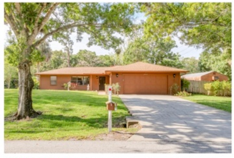
FOR SALE: 6915 Towhee Dr, built 1989, 1684 SF, 3/2 on .43 acre. Asking $499,000 or $296/SF.