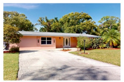
FOR SALE: 6592 Ward Pkwy, built 1959, 1930 SF, 3/3 on .46 acre. Asking $439,900 or $228/SF.