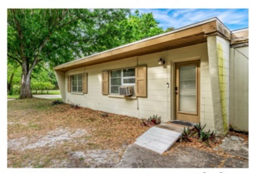
SOLD Apr 22: 299 Dayton Blvd, built 1956, 1176 SF, 2/1 on .41 acres, sold for $195,000 or $166/SF.