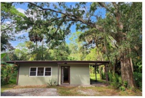
FOR RENT: 5680 Crane Rd, updated 1160 SF, 2 /1 with office, open parking, no pets $2,100/mo.