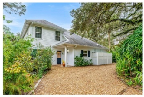
FOR SALE: 5800 Live Oak Ave, built 2018, 2094 SF, 3/3 on .37 acres asking $575,000 or $275/SF.