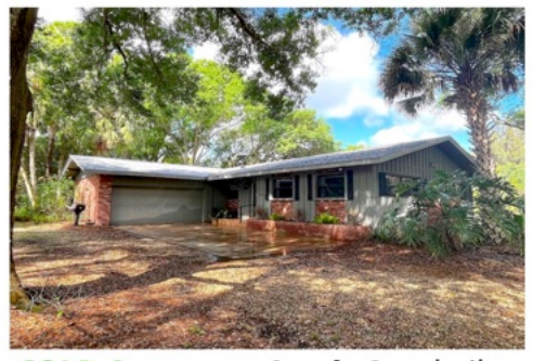
SOLD Apr 9: 795 Acacia Ave, built 1964, 1915 SF, 3/2 on 1.59 acres sold for $480,000 or $251/SF.