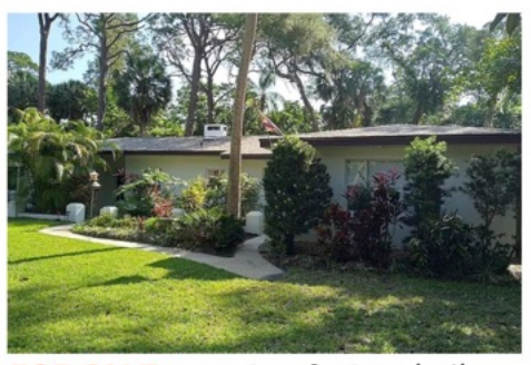
FOR SALE: 550 Acacia Ave, built 1950, 2275 SF, 3/3 on .69 acres asking $585,000 or $257/SF.