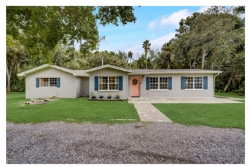
FOR SALE: 6674 Flamingo Rd, built 1957, 2214 SF, 3/3 on 1 acre w/ pool. Asking $590,000 or $266/SF.