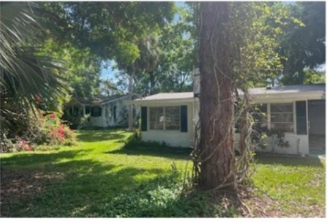
UNDER CONTRACT: 6727 Blue Jay Ln, Built 1957, 1336 SF, 3/2 on .84 ac asking $399,000 or $299/SF.