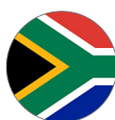
Pretoria, South Africa 1998