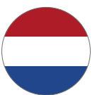
Den Haag, Netherlands 1992