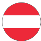
Vienna, Austria 1930