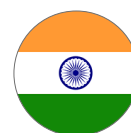
Chennai, India 2013