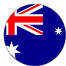
Melbourne, Australia 2019