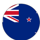
Christchurch, New Zealand 1995