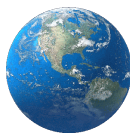
Special World Conference Online, 2021