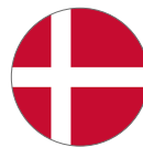
Copenhagen, Denmark 1950