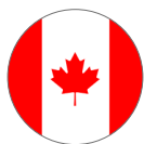
Vancouver, Canada 1983