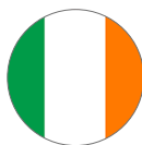
Killarney, Ireland 1986