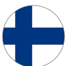
Turku, Finland 2007