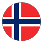
Oslo, Norway 1971