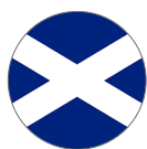
Edinburgh, Scotland 1959