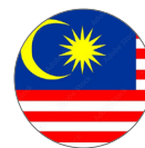
Kuala Lumpur, Malaysia 2023