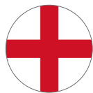
London, England 1939