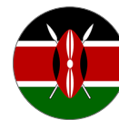
Nairobi, Kenya 1977