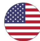
Kansas City, USA 1989