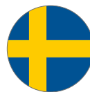
Stockholm, Sweden 1933