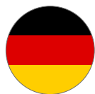
Hamburg, Germany 1980