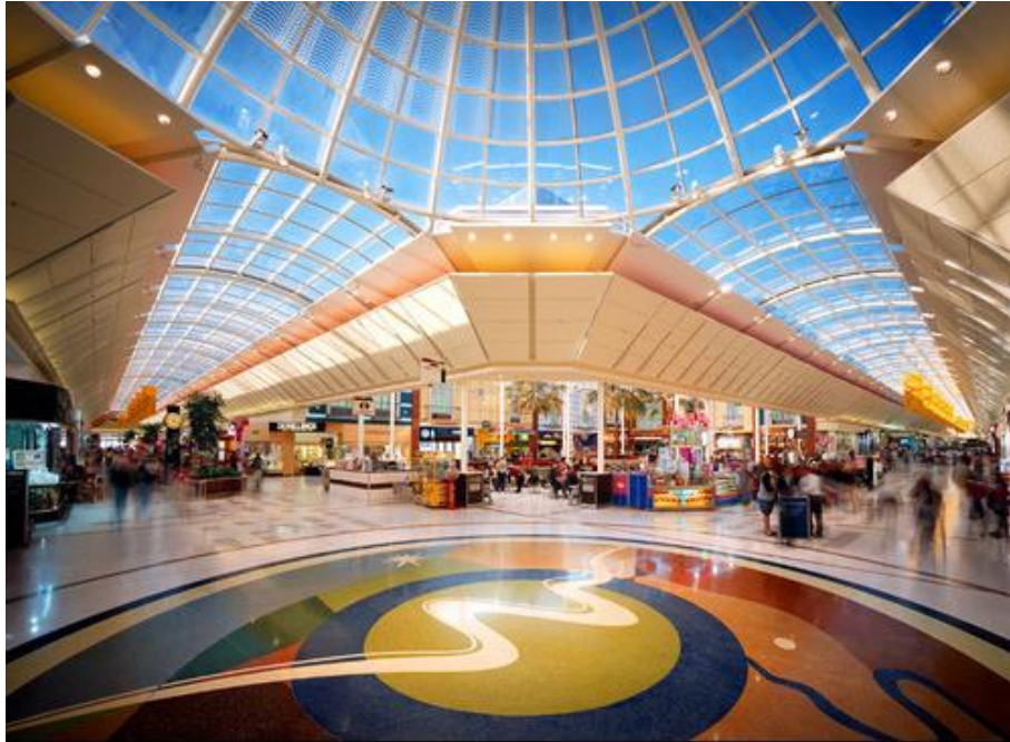
Pacific Werribee Shopping Centre