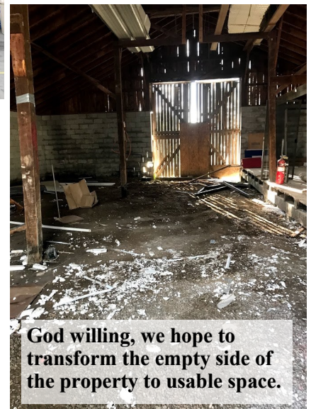
God willing, we hope to transform the empty side of the property to usable space.