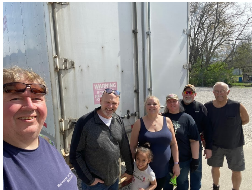
The crew unloading the MFB semi

We must keep our eyes on Jesus. Our way of life as we know it has changed, but the love that we have for one another has not changed. There is still a great need to help the people of Eastern Appalachia Kentucky, now more than ever! When we were planning our April distribution, we wondered how many volunteers would show up to help. How many food pantries were going to be open? Will any of us get the COVID-19 virus after the distribution? So many thoughts and worries that were completely uncalled for, because the answer was to "Turn Your Eyes Upon Jesus and Look full in His wonderful face, And the things of earth will grow strangely dim, In the light of His glory and grace!" We were unable to meet up with our soup distributor, but still had some soup from the previous month, so we made it work. Thirty five of our food pantries showed up for their distribution times and of course Jesus took care of all of our worries. We had many new volunteers both from Illinois and Kentucky. The local community of Stanton, KY really responded to our need for volunteers and provided all the help we needed. We were so appreciative of their help! So COVID-19 does not just bring despair, but it brought us the opportunity of joining together in caring for others in need!