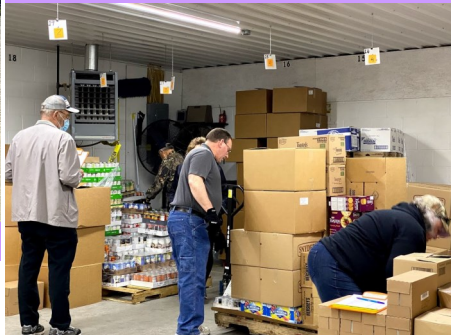
Volunteers putting together pallets of food for distribution