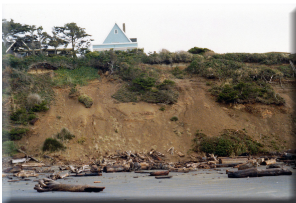
Coastal Slope Stability Mapping