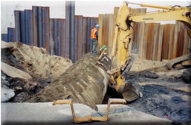
Sheet Pile Slope Protection During Tank Removal