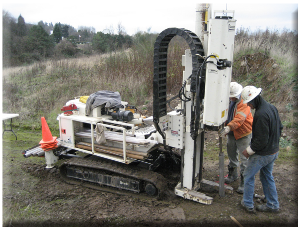
Shallow Core Drilling