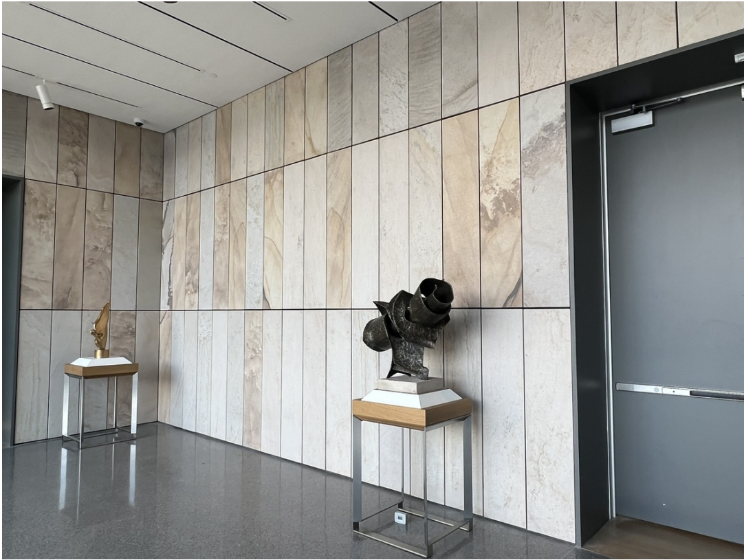
Interior wall panels for large and small projects.