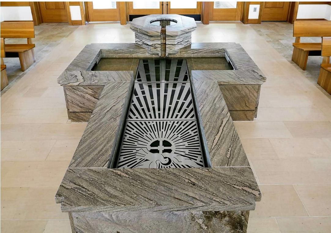
Our craftsmen are able to provide quality carvings whenever unique designs are required.