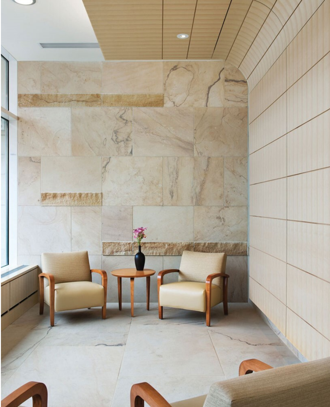
Interior walls and flooring in a variety of textures and color ranges