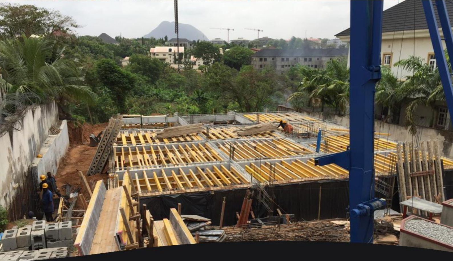
Residential Villa at Ontario Crescent Maitama, Abuja