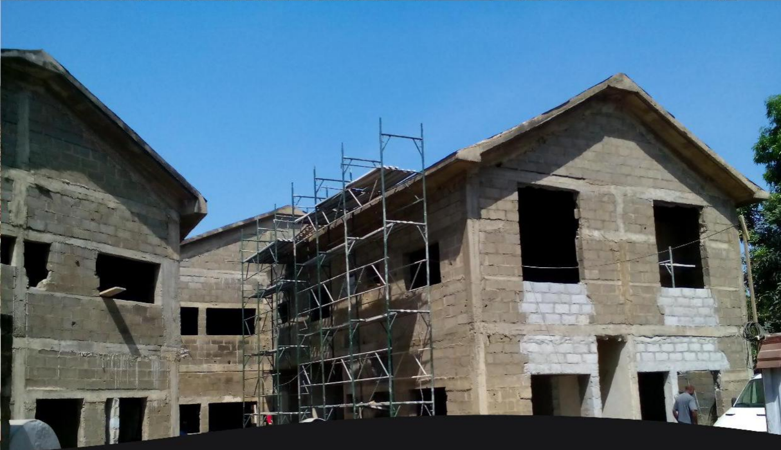
Four Semi-attached Duplexes at Maitama, Abuja