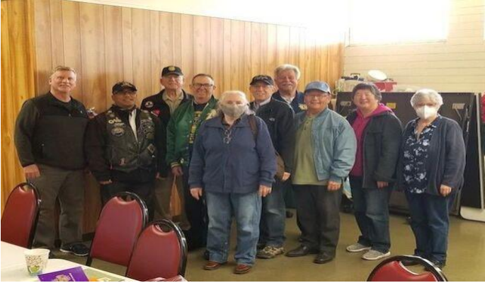
AL Post 105 Family unit members at the Commanders Coffee event on Wednesday, January 26, 2022.

The Post 105 participates in various local and state veteran events for supportive services for veterans and their families. The following pictures illustrating examples of Post 105 supportive services for veterans and their families during an event in local communities. It's our post commitment for quality services supporting our veterans and their families – exemplifying by action throughout communities! (THANKS to all photographers for pics)