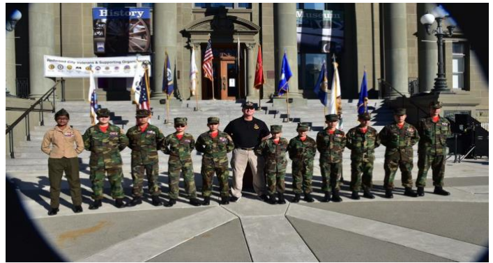
Golden Gate Young Marines at the Veterans Day Celebration in Redwood City on November 11, 2021.