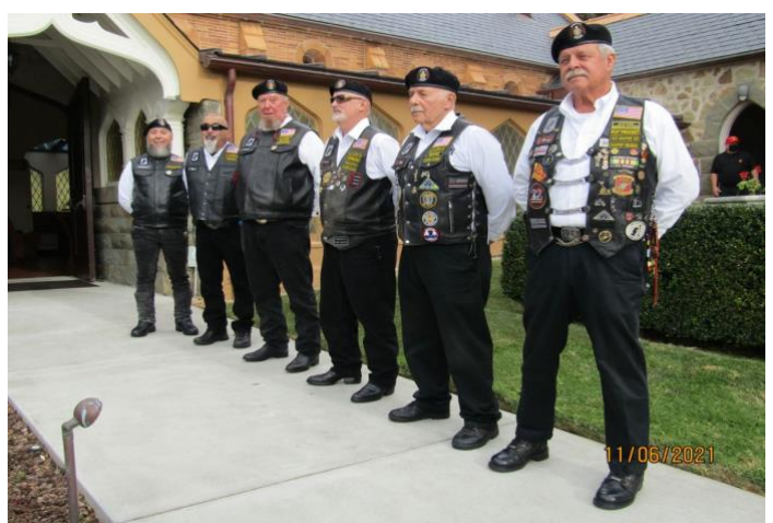
ALR Post 105 Family members during a Flag Retirement Ceremonial event on November 6, 2021.