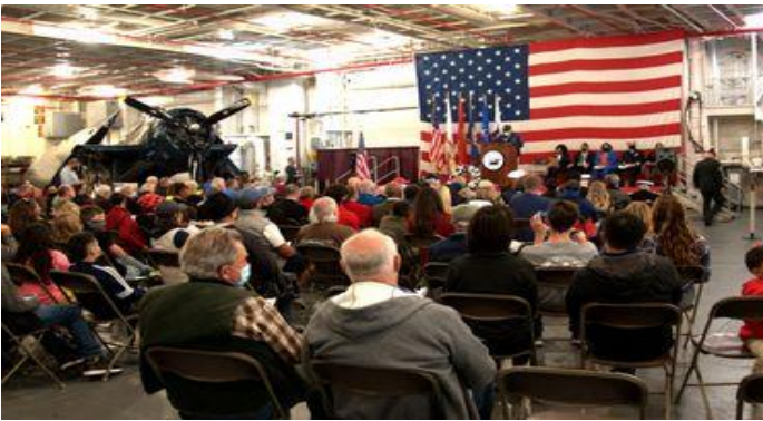
Participants at the USS Hornet Veterans Day Celebration on November 11, 2021.