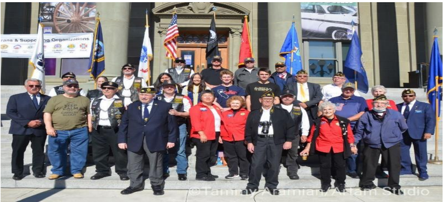
Our veterans community post is raising funds for humanitarian assistance in Eastern Europe, and helping families with children affected by therein wars currently happening and helping Ukrainian refugees. Please visit our website at www.americanlegionpost105rwc.org for more information.