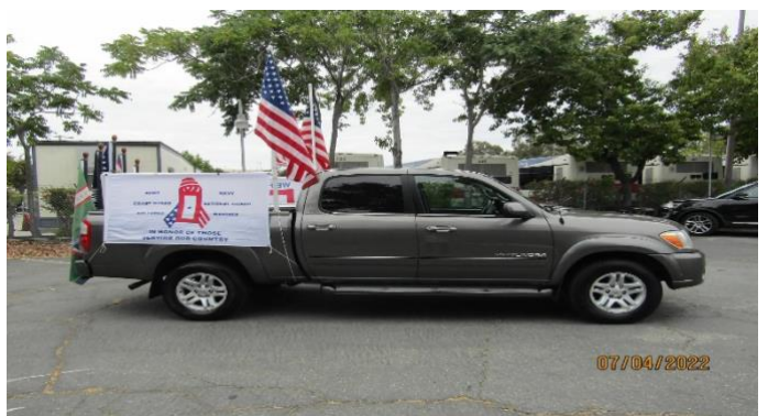
Blue Star Moms float preparation for therein parade in downtown Redwood City.